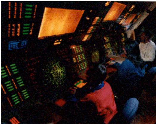
DFW Approach Control (Dark Room)