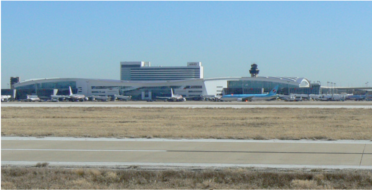
One of the New DFW Terminals with ATC Tower in background.