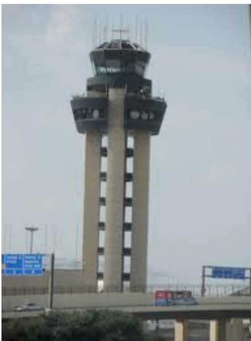
DFW Center Tower